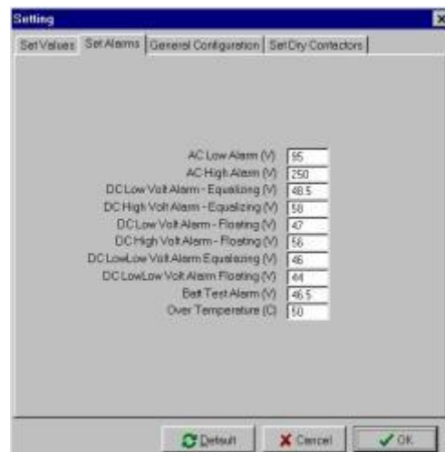
Set alarm activation parameters screen